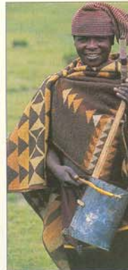
ABOVE: the natives are fortunately, quite friendly. LEFT: sounds daft, but Conical Hat through Lesotho