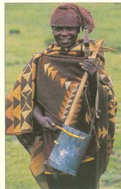
ABOVE: the natives are, fortunately, quite friendly LEFT: sounds daft, but driving Series Is through Lesotho