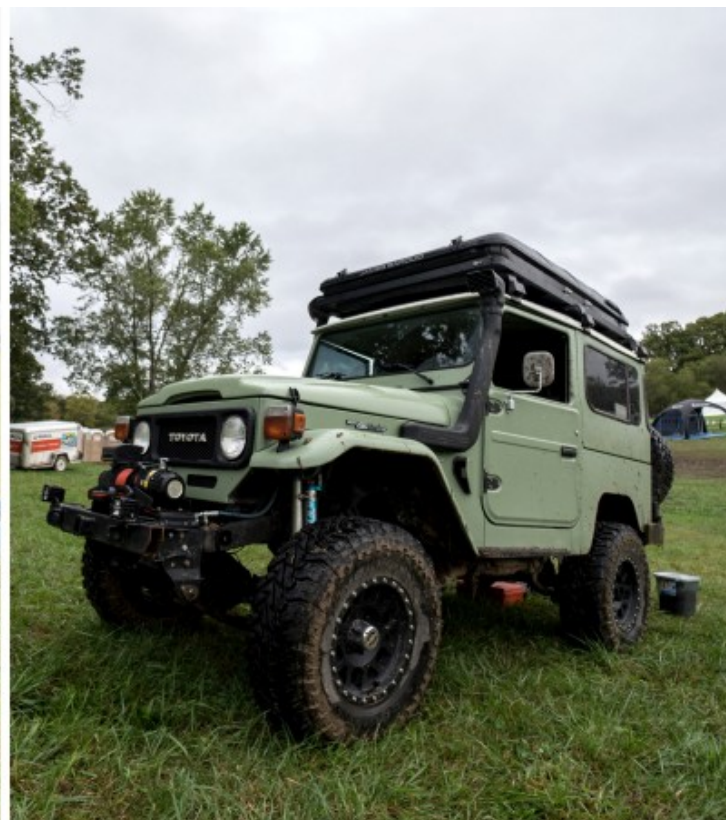
Indestructible vehicles of all kinds—jeeps, trucks, vans, and bikes—made an appearance at this year's Overland Expo.